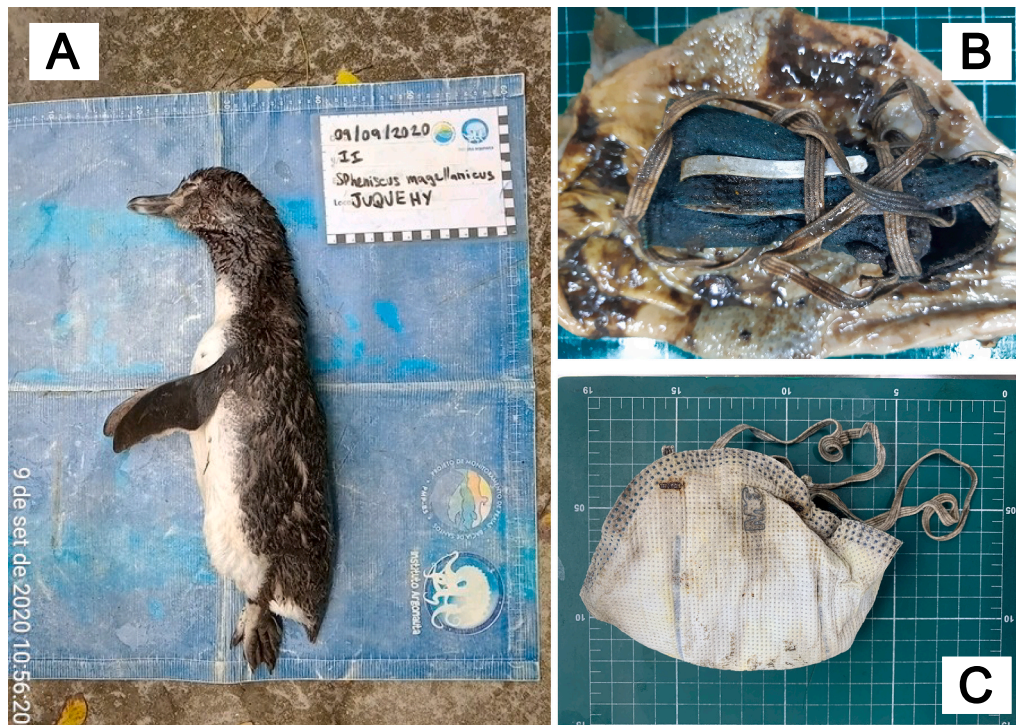
Fig. 3. Penguin found dead in São Sebastião (A). Mask inside the open stomach during the necropsy (B). Detailed face protective mask (C).

these, 98.5% (463/470) were juveniles, with 74.5% (345/470) females and 20.3% (94/470) males. From the same group analyzed in this article, 15.3% (71/470) showed interaction with anthropogenic solid waste, with a proportion of 81.7% (58/71) of females, to 16.3% (9/71) of males (Argonauta Institute, unpublished data). In that period, it was only this one penguin, discussed in this study, that displayed evidence of interaction with a protective face mask.